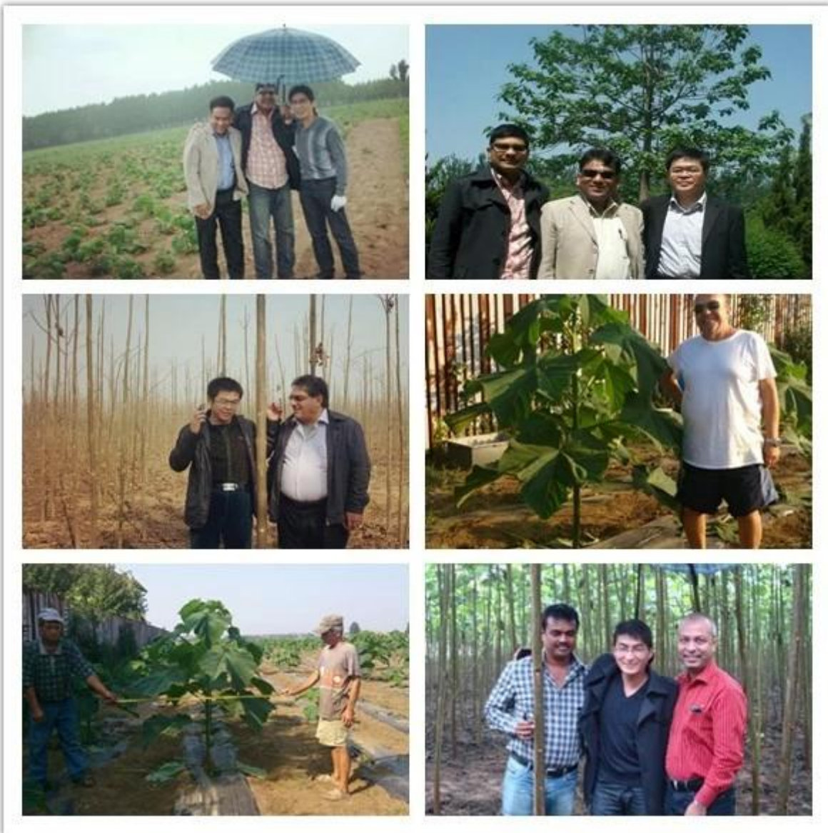
Feedback pictures from our customer: