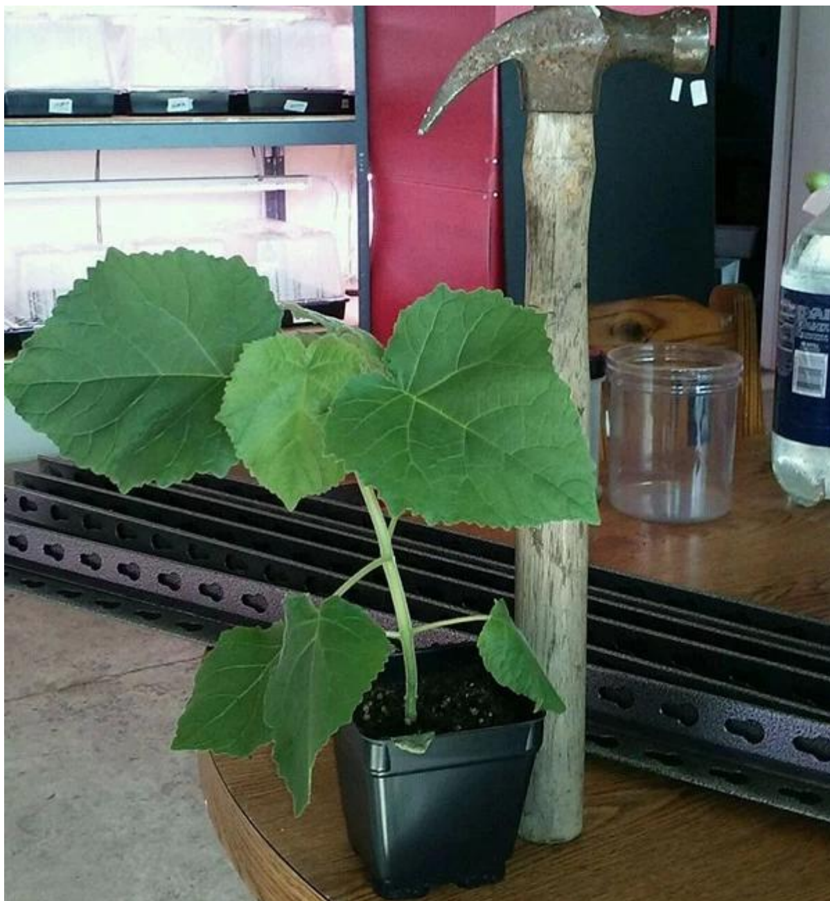
Paulownia roots & paulownia stumps in our factory