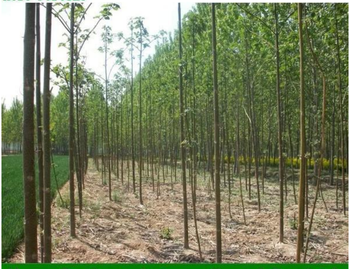
Heze Fortune International Co.,Ltd.