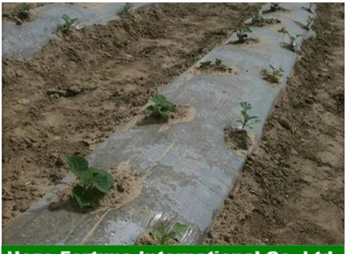
Heze Fortune International Co.,Ltd.