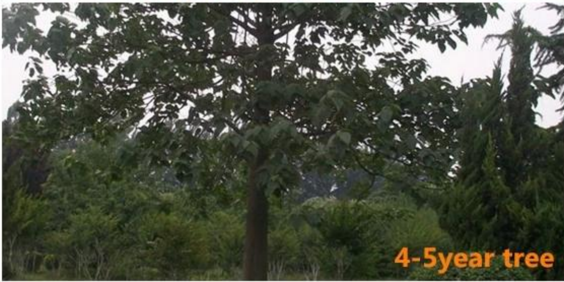
4-5 year tree