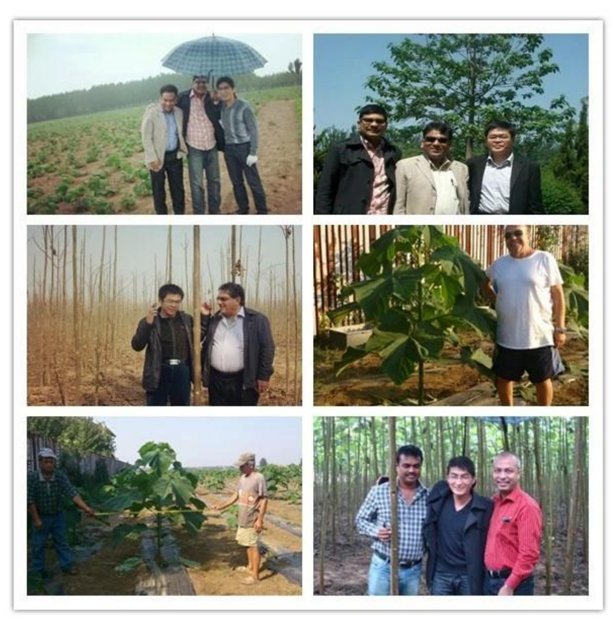
Feedback pictures from our customs: