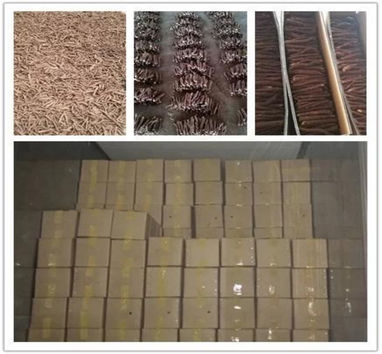
Paulownia stump package