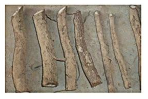
2-2. Cut root system to small pieces.