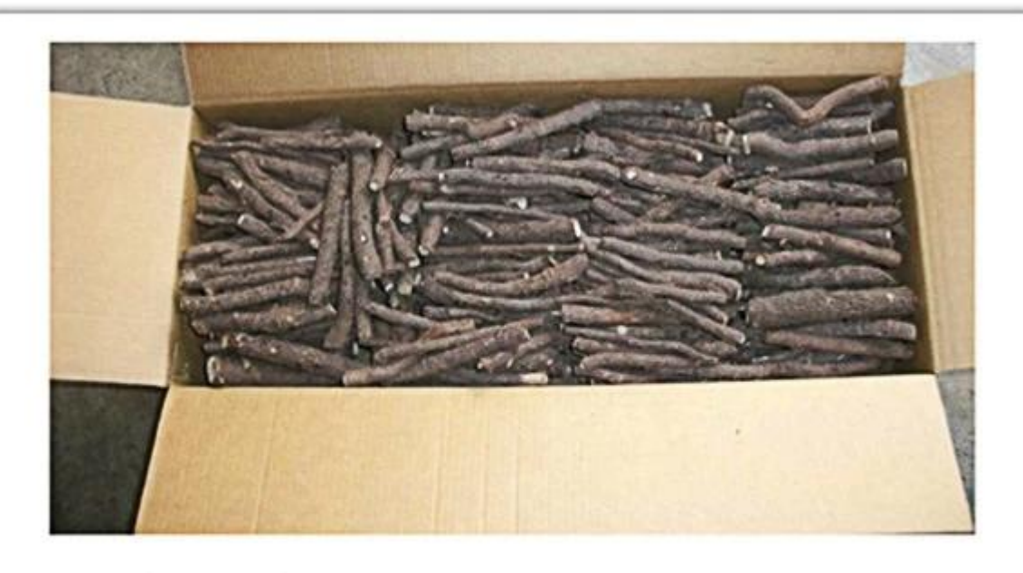
6.Packing them. Normally 1000pcs root in one carton.