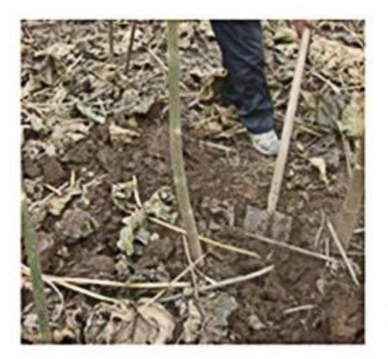
1.Dig out one year paulownia tree