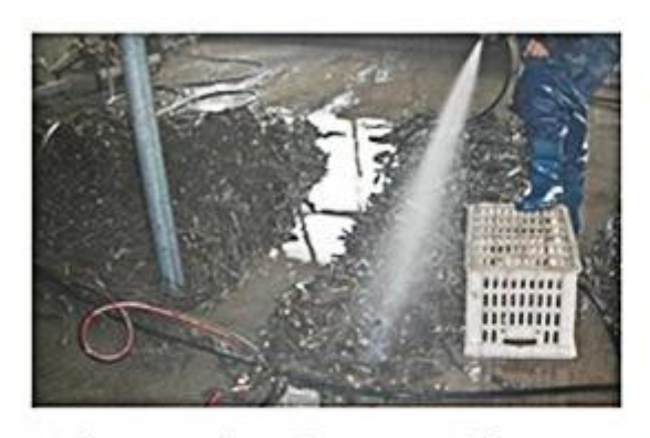
3.Clean paulownia roots with water.