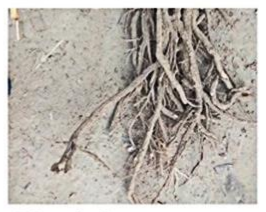
2. Cut paulownia tree root system