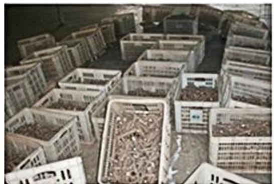
5-1. Dry them in plastic container