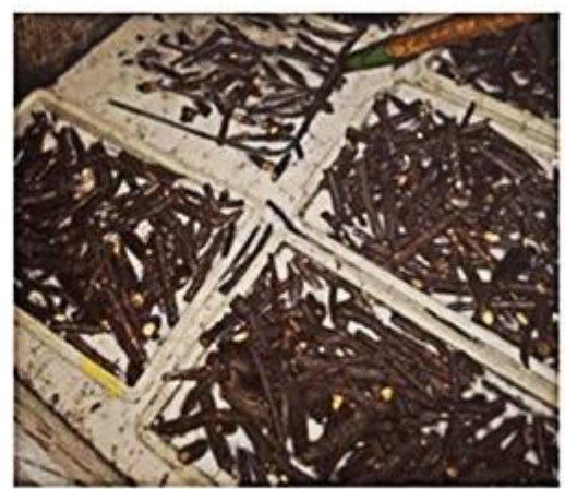
4.Desinfect paulownia root with chemical-cypermethrin