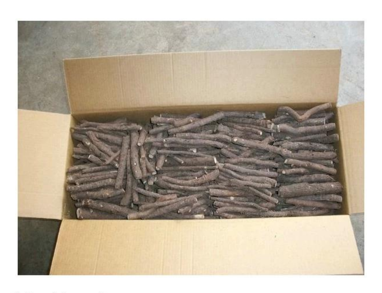
6.Packing them. Normally 1000pcs root in one carton.