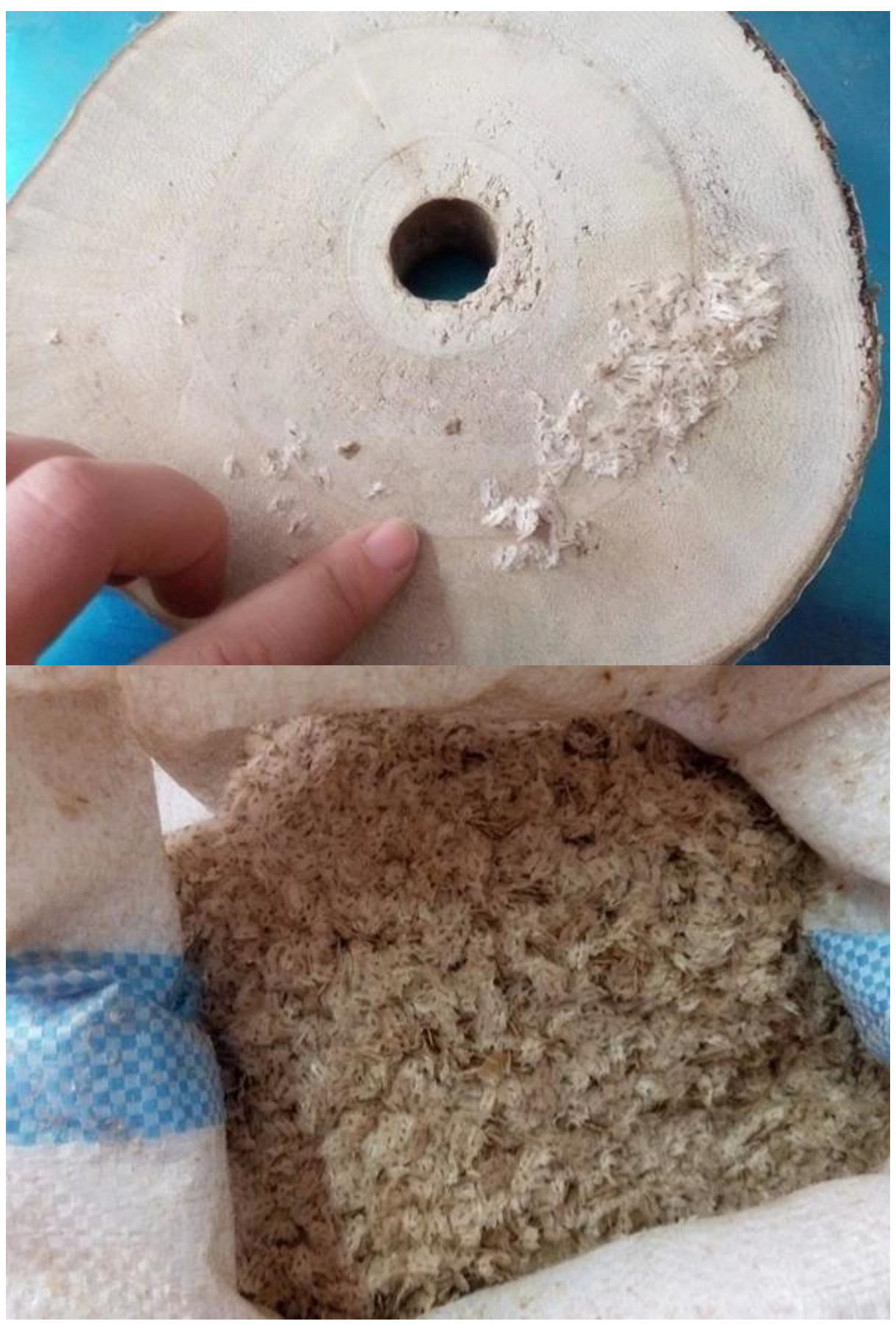
Please see paulownia root process as follows: