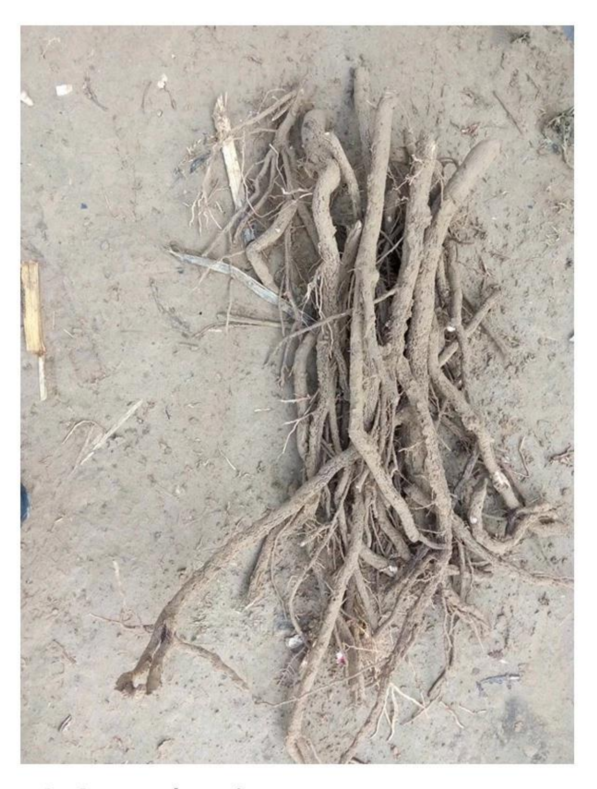
2. Cut paulownia tree root system