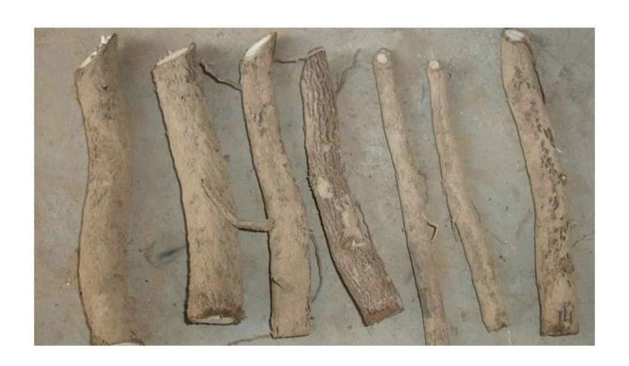
2-2. Cut root system to small pieces.