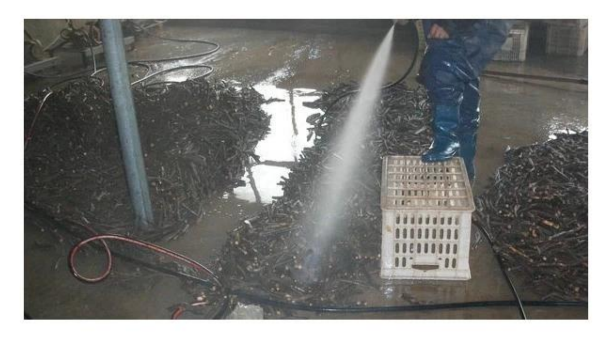
3.Clean paulownia roots with water.