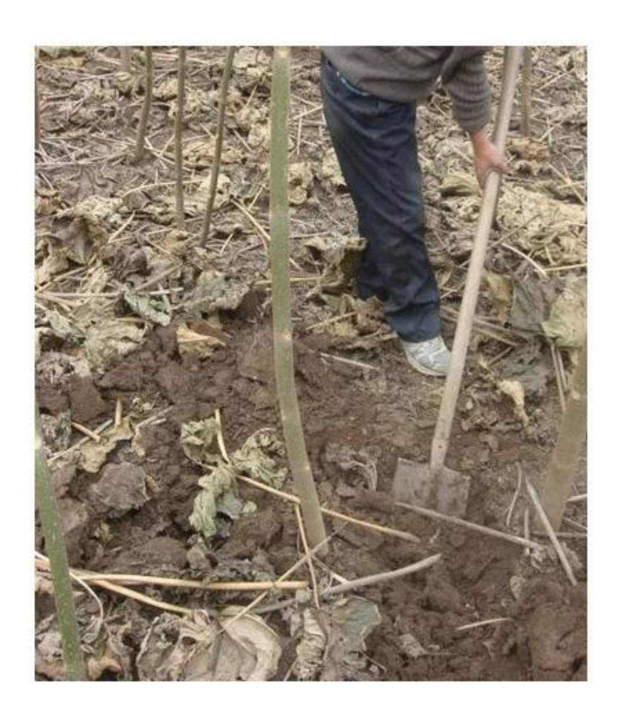
1.Dig out one year paulownia tree from our paulownia plantation