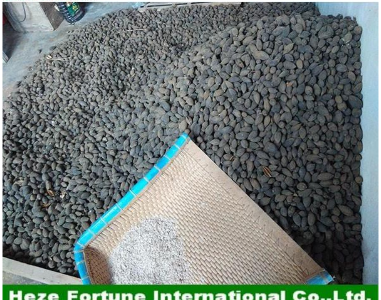
Heze Fortune International Co.,Ltd.