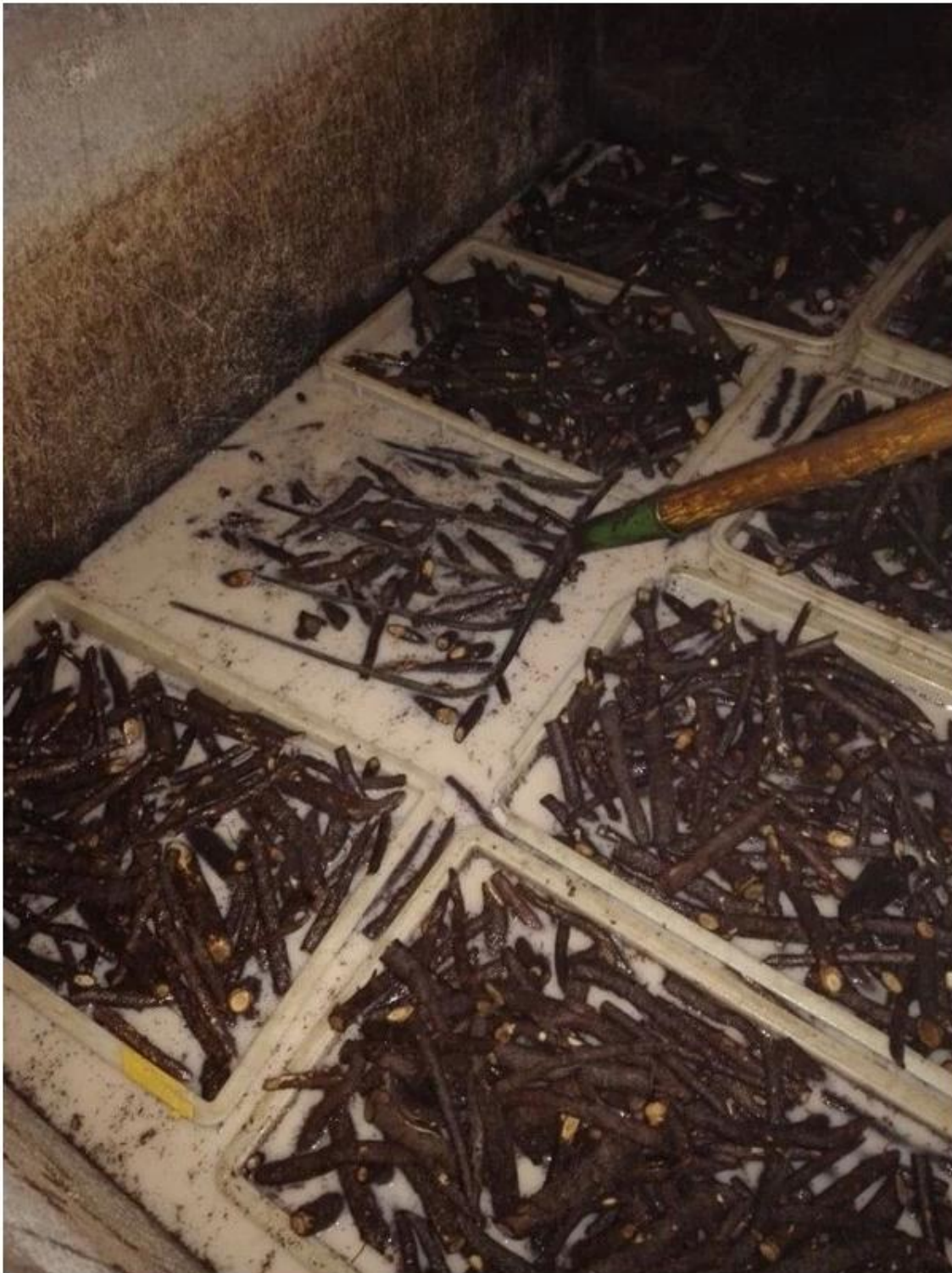
4.Desinfect paulownia root with chemical-cypermethrin