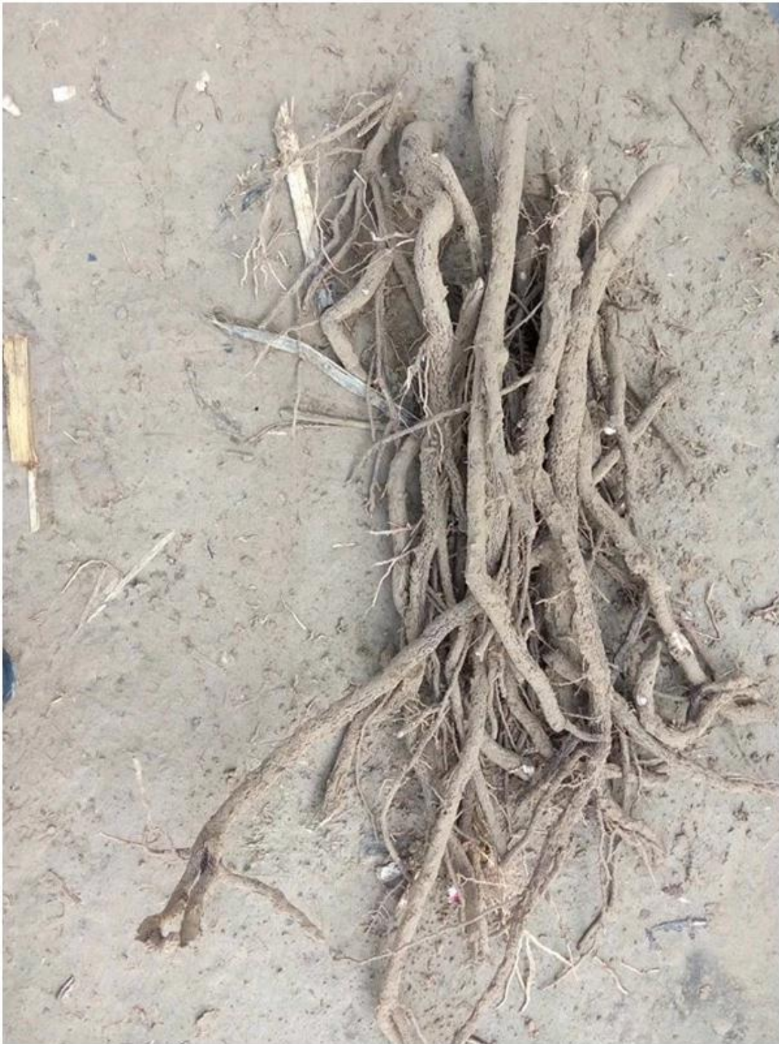
2. Cut paulownia tree root system