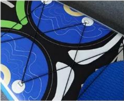
Bungee Rope Large Storage Space