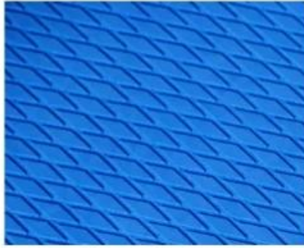
Non-slip EVA Friendly Surface