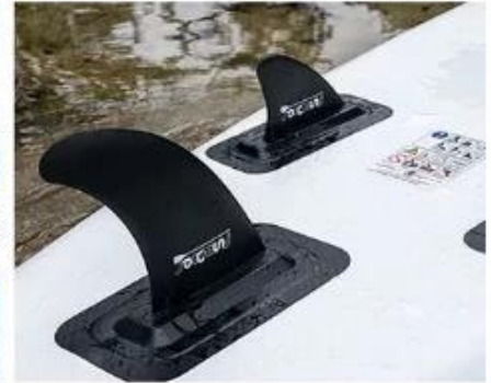
Three Slide Fins