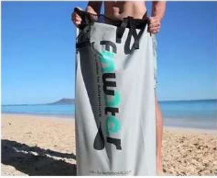
Easy To Store