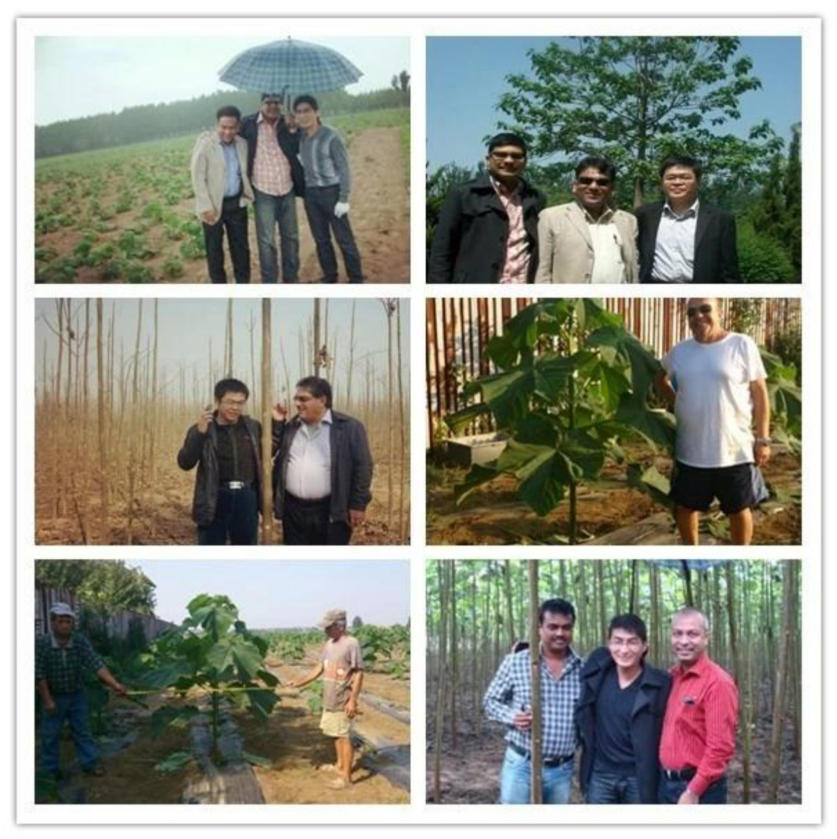
Feedback pictures from our customers: