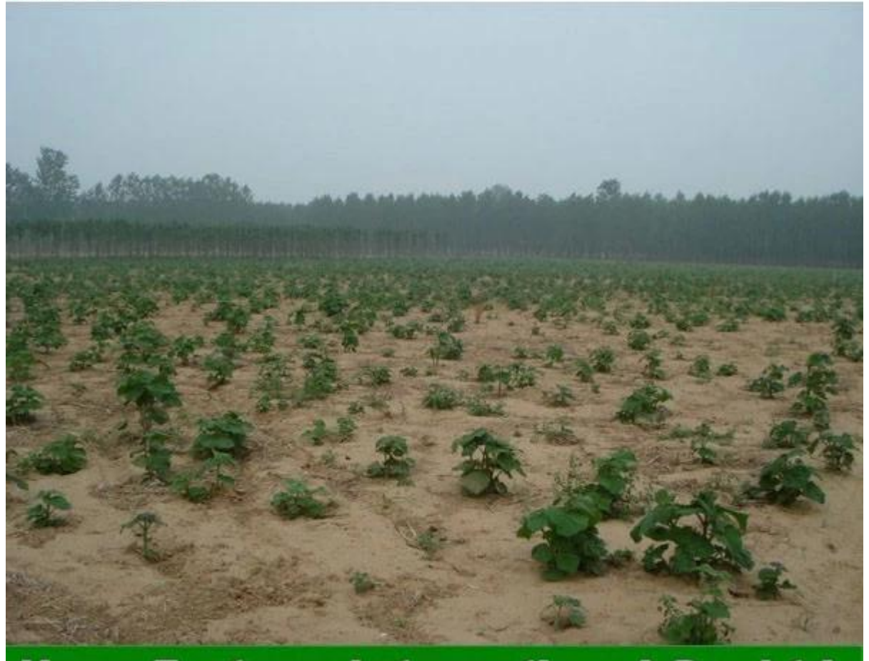
Heze Fortune International Co.,Ltd.