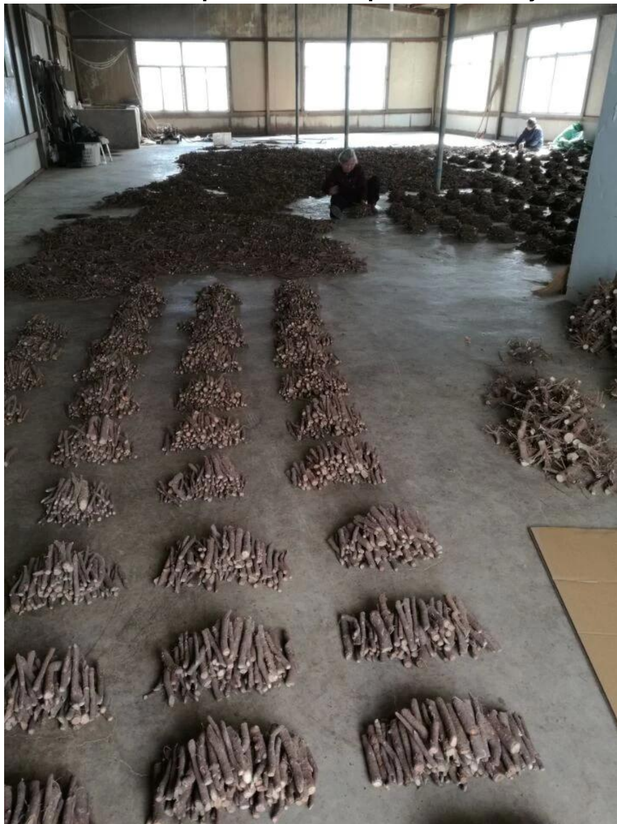
Paulownia roots & paulownia stumps in our factory