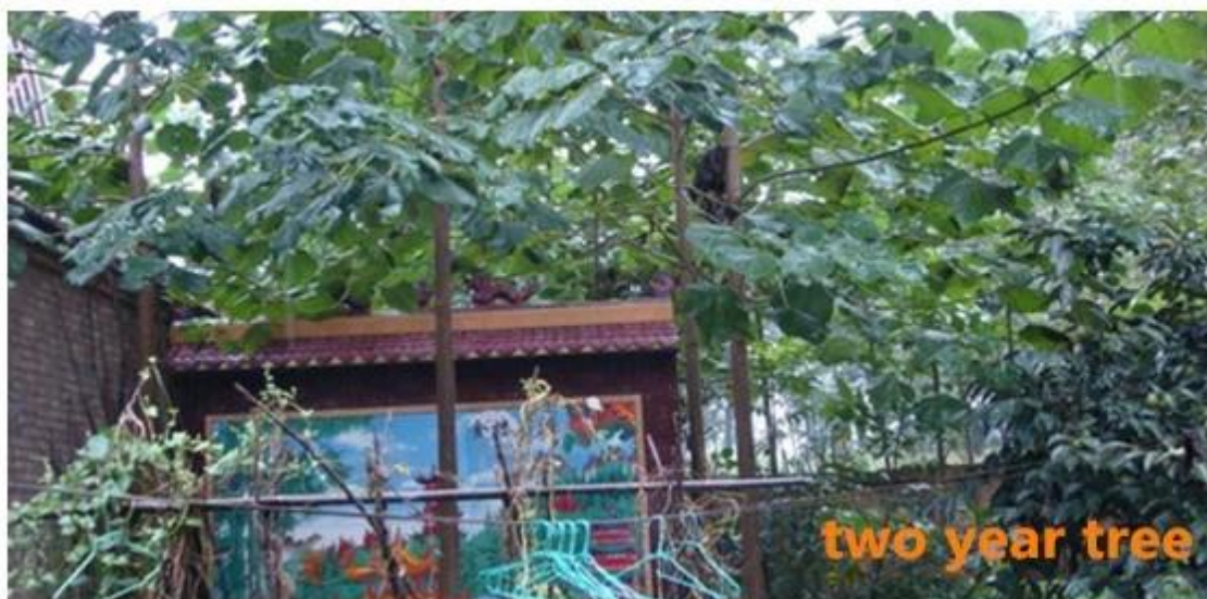
two year tree