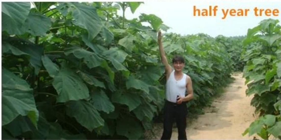
half year tree