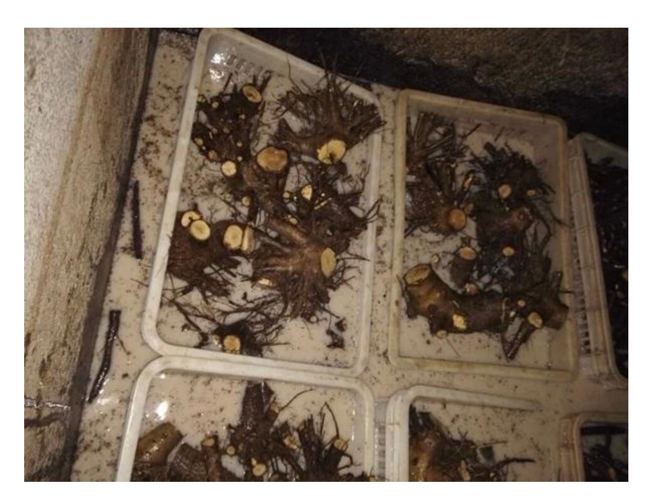
5.Dry paulownia stump