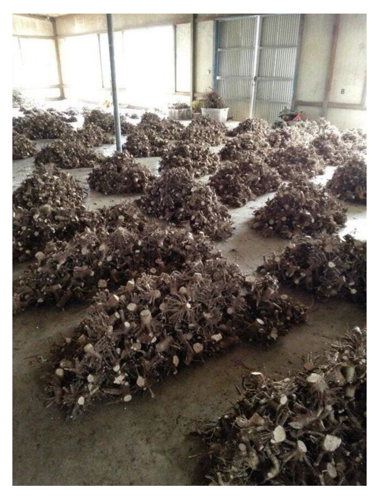
6.Packing paulownia stump