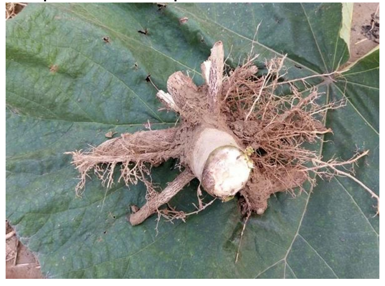
3.Clean paulownia stump with water