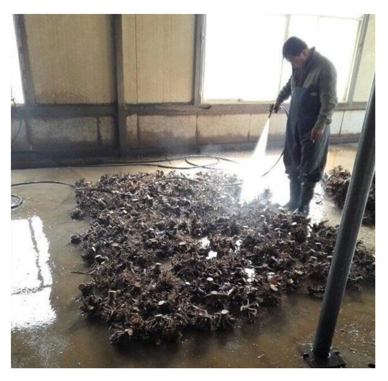
4.Disinfected paulownia stump