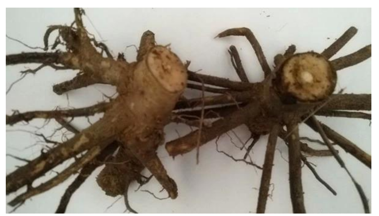
1.Dig out one year paulownia tree from our paulownia planting base