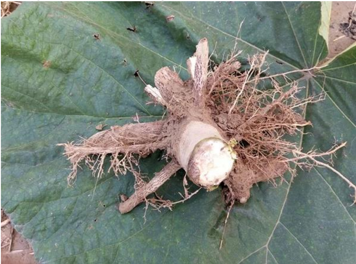
3.Clean paulownia stump with water