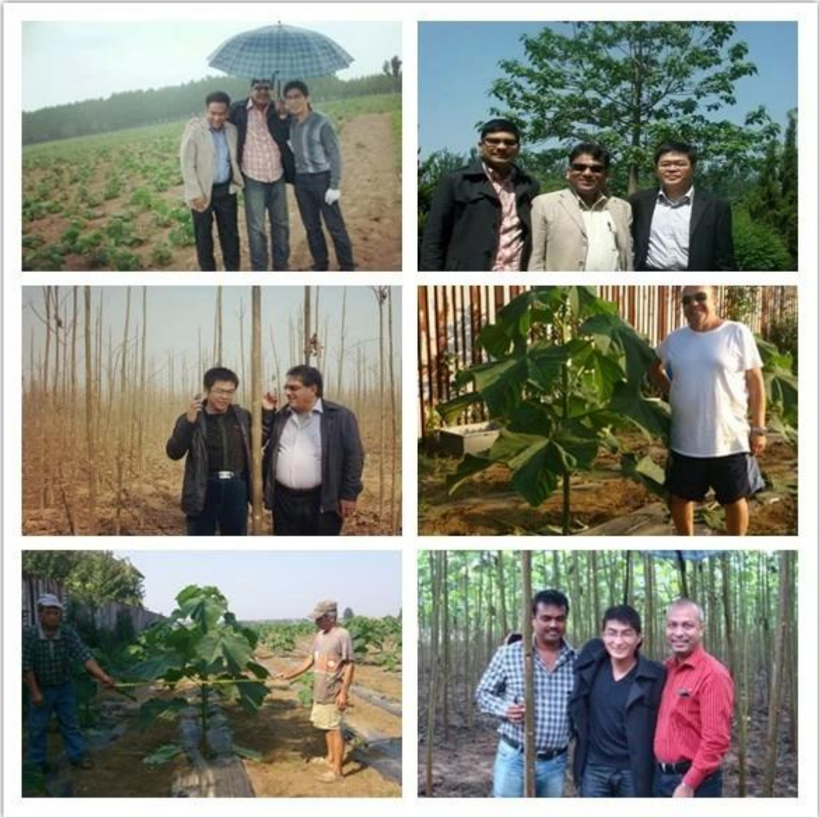
Feedback pictures from our customers: