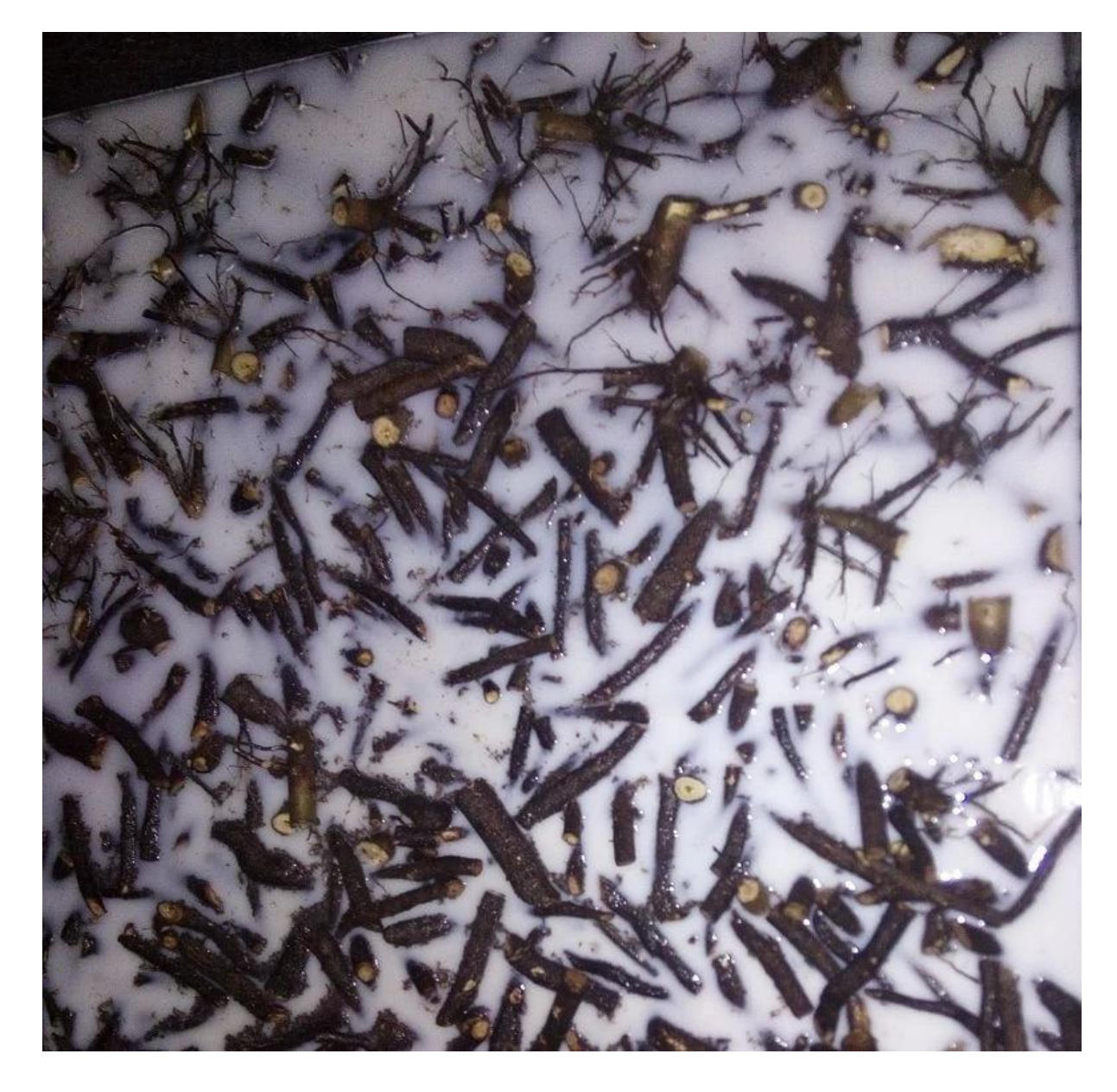
Packing paulownia root