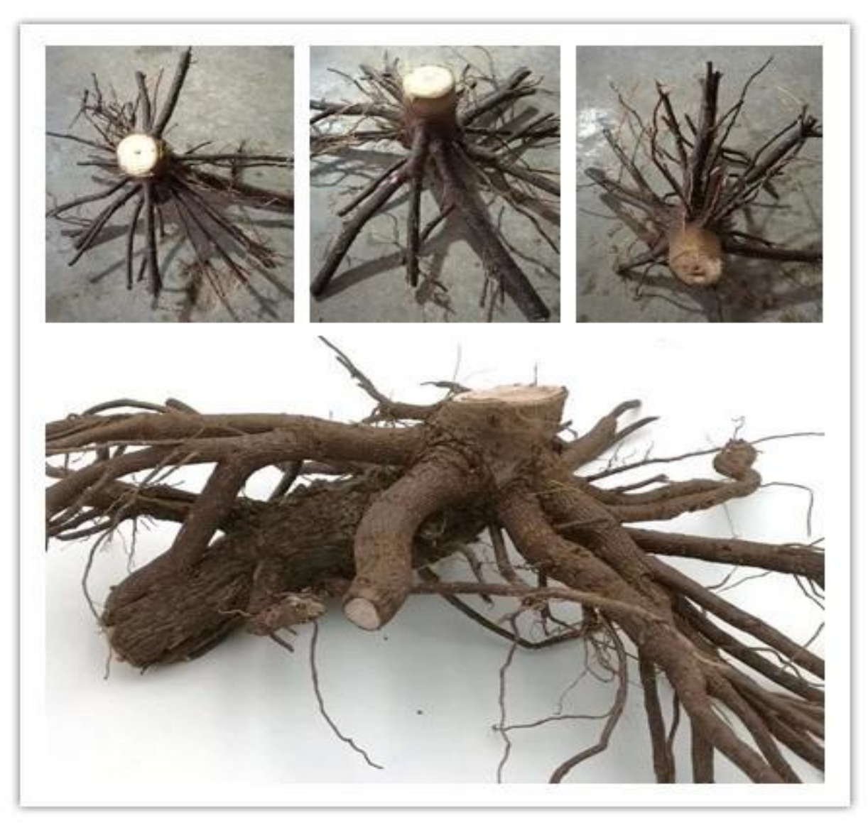
Disinfection paulownia root