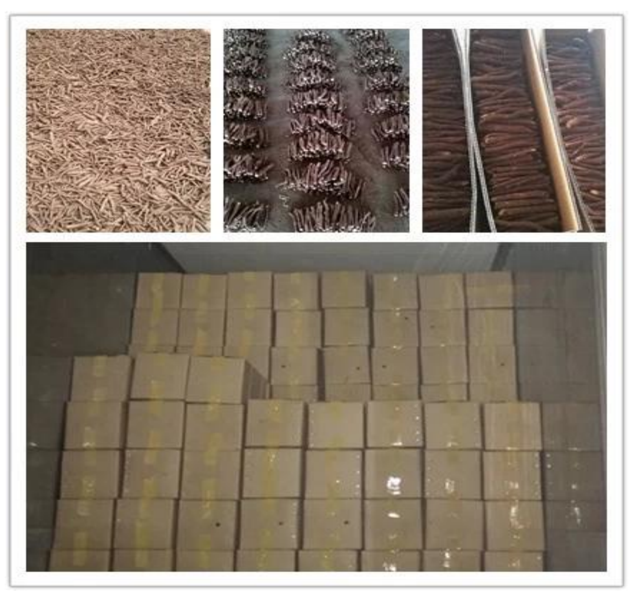
Paulownia stump package