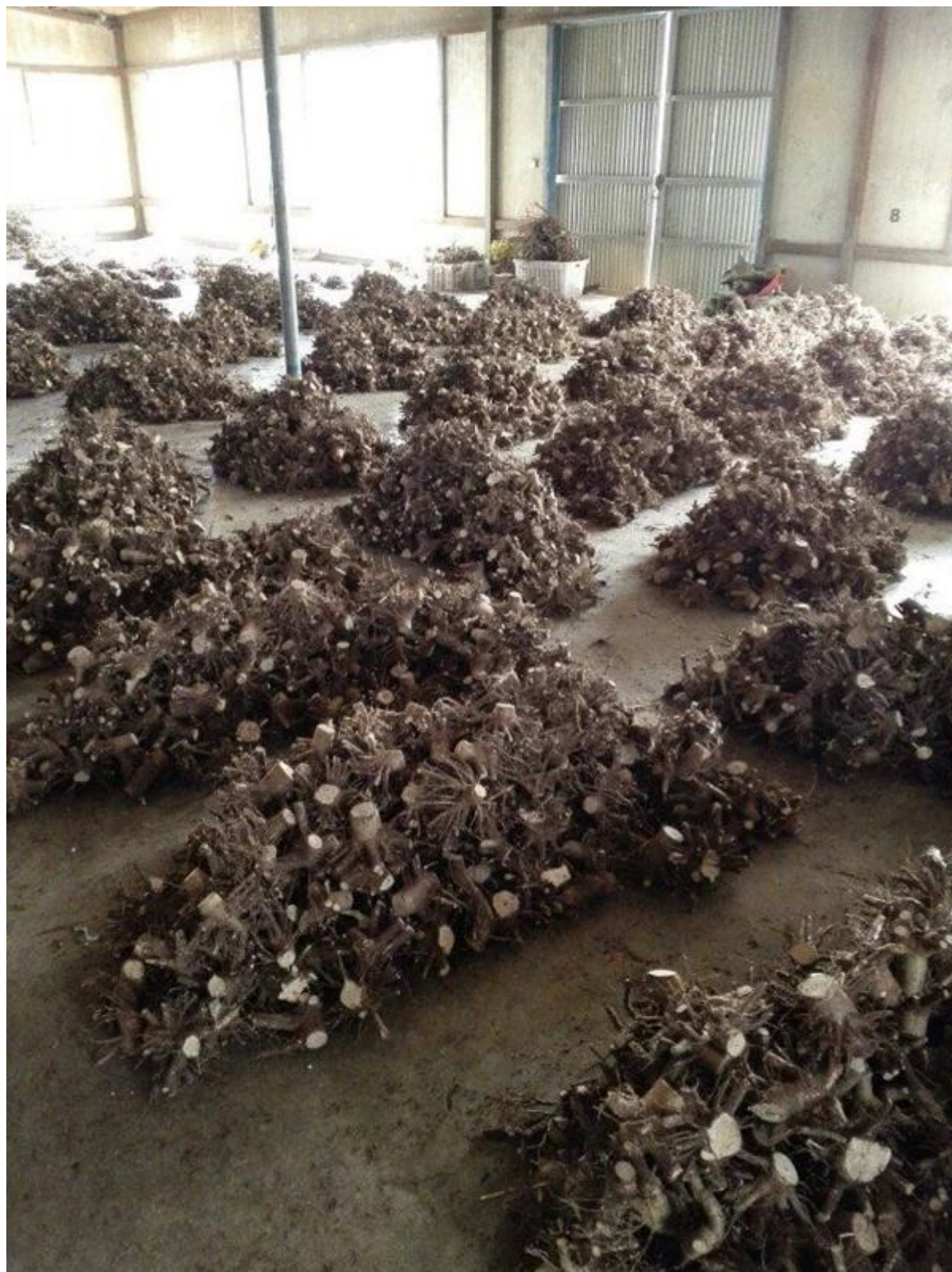
6.Packing paulownia stump