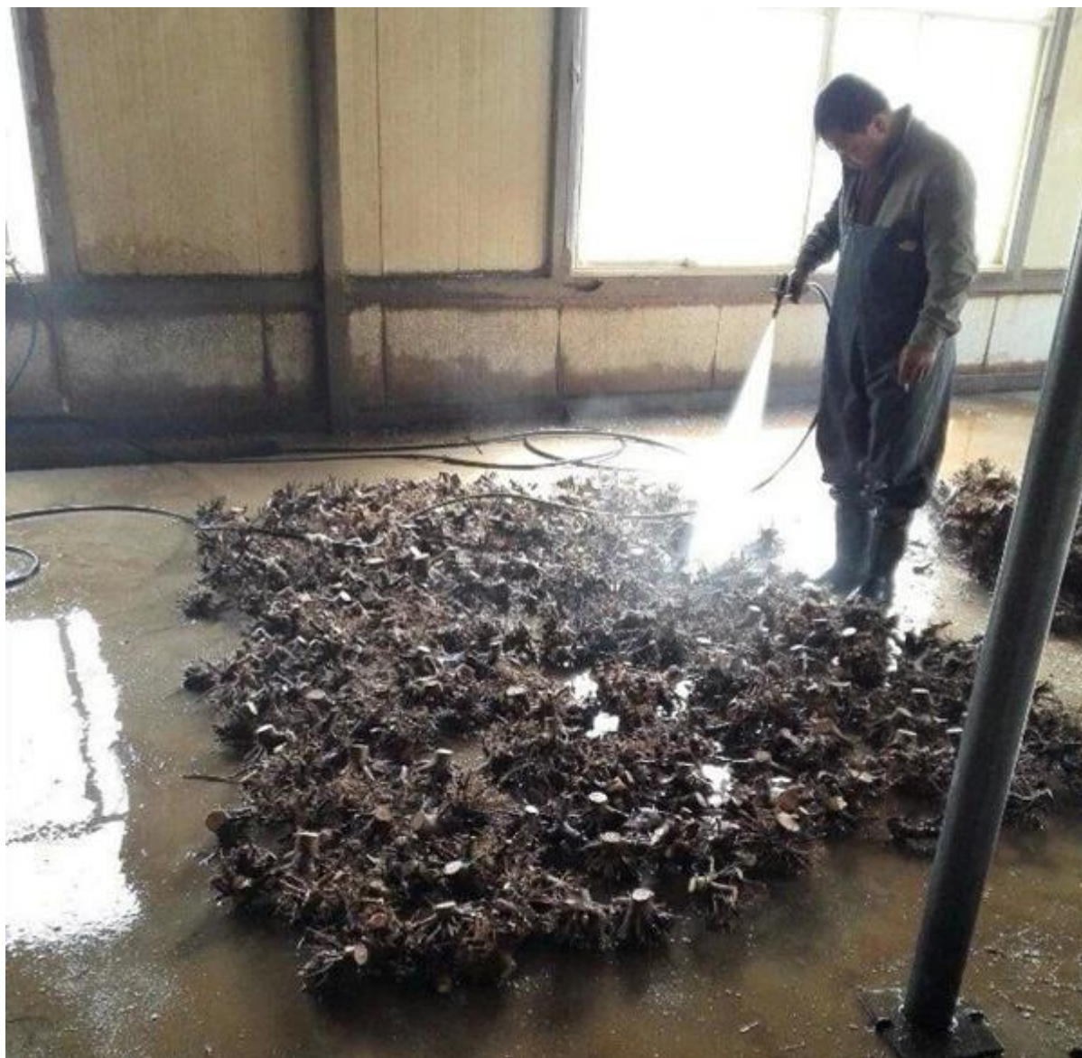
4. Disinfected paulownia stump