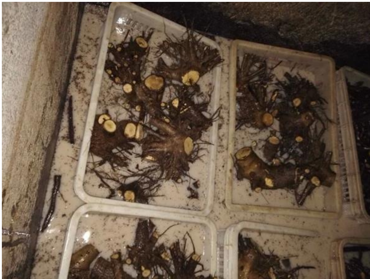
5.Dry paulownia stump