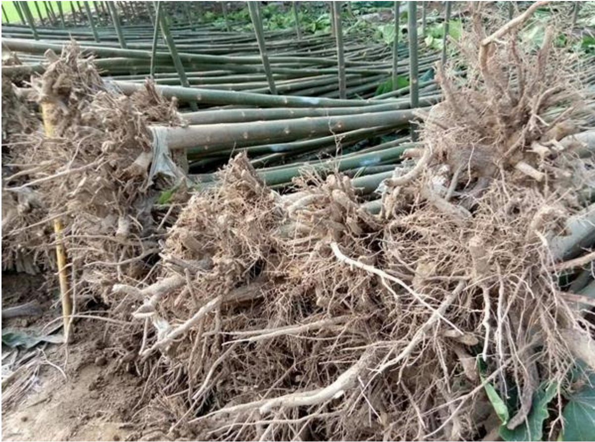
2.Cut paulownia tree stump