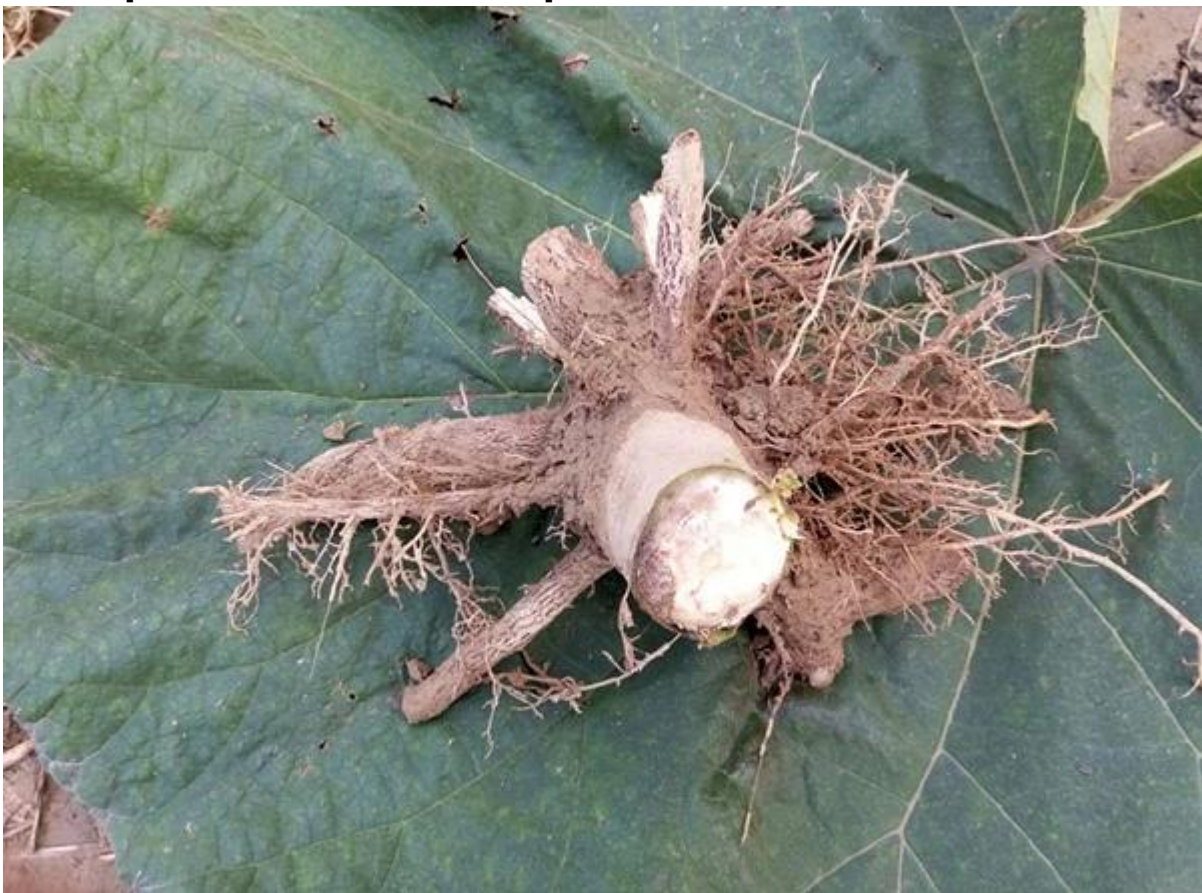
3.Clean paulownia stump with water