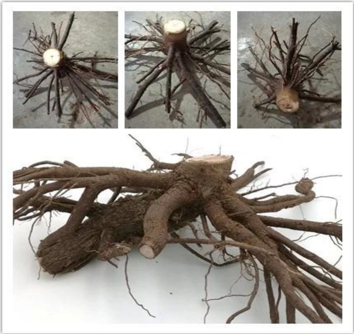
Disinfection paulownia root