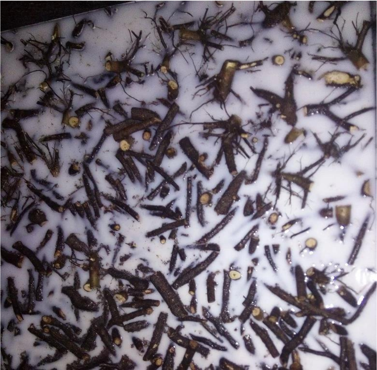
Packing paulownia root