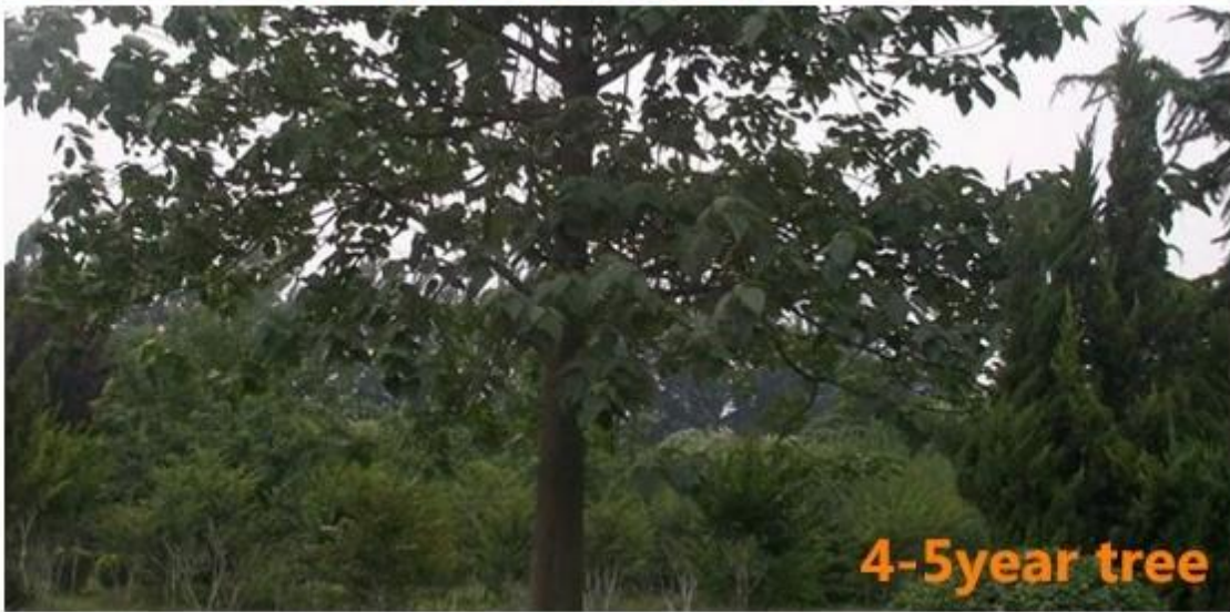
4-5 year tree