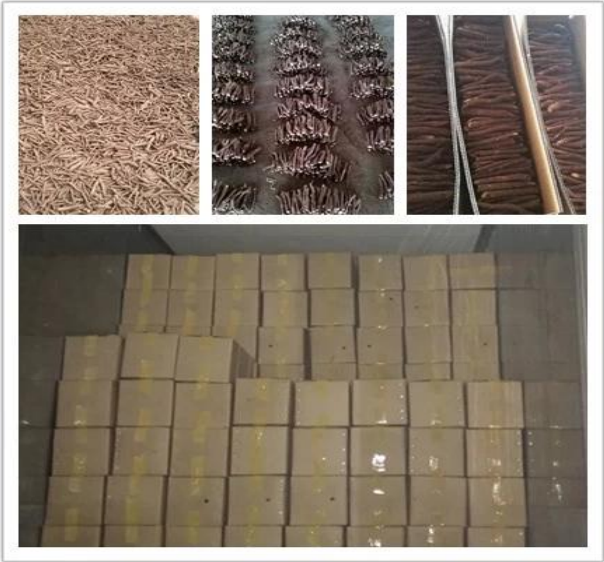
Paulownia stump package