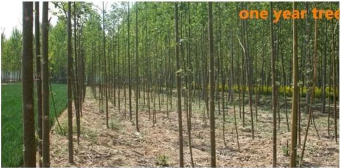
one year tree