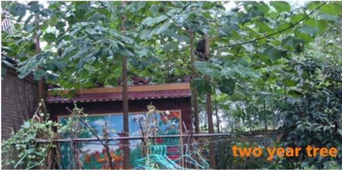
two year tree