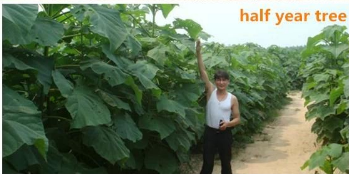
half year tree