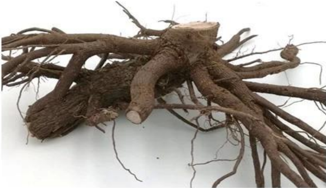
Disinfection paulownia root