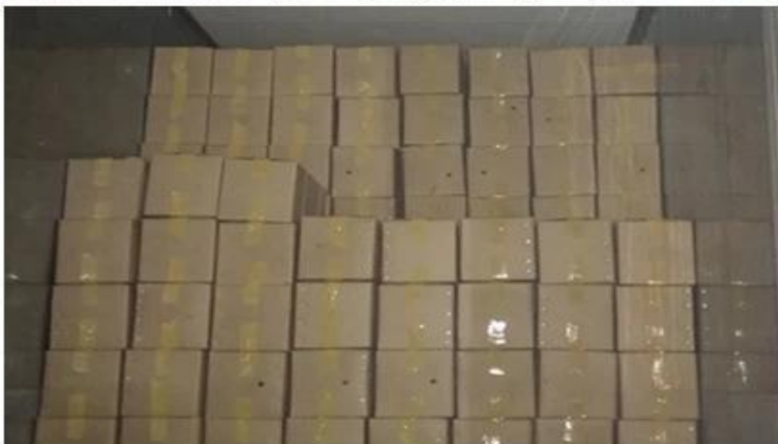
Paulownia stump package