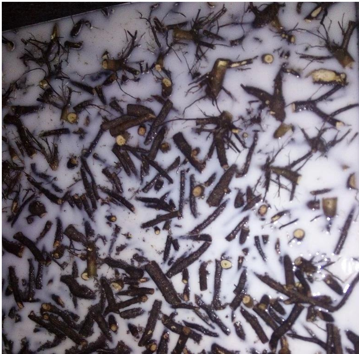
Packing paulownia root