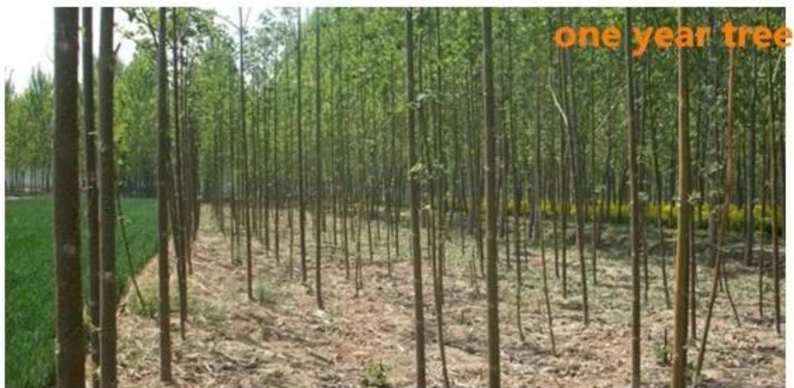
one year tree