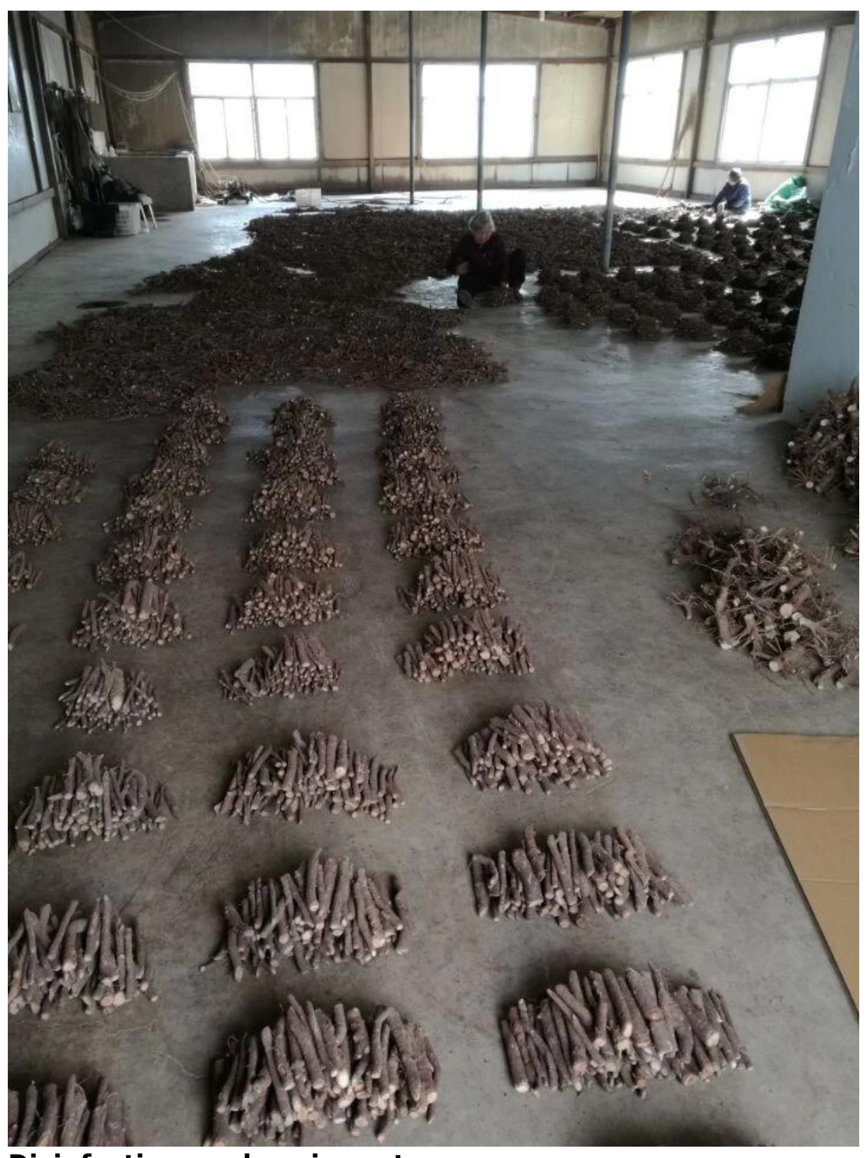
Disinfection paulownia root