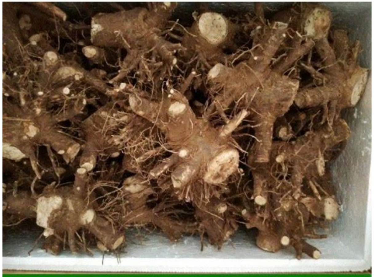
Heze Fortune International Co.,Ltd.