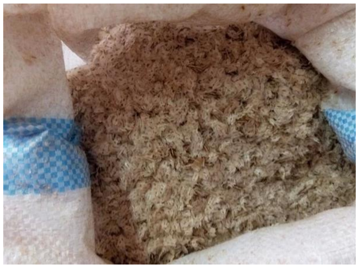
Please see paulownia root process as follows: