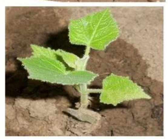
Heze Fortune International Co.,Ltd.