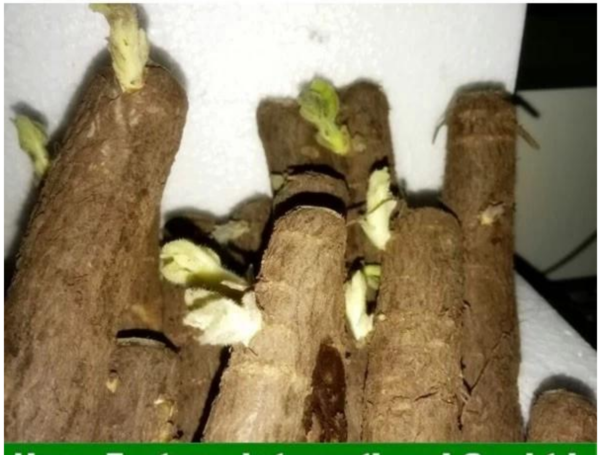
Heze Fortune International Co.,Ltd.