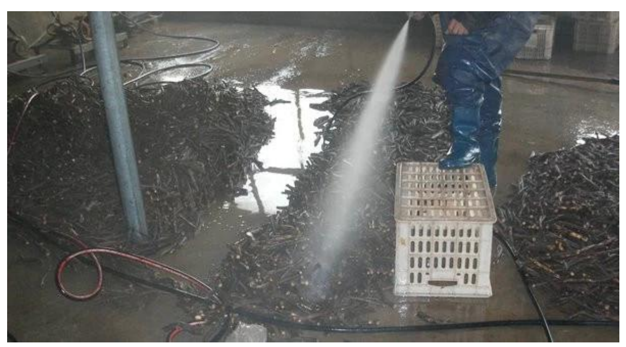
Disinfection paulownia root